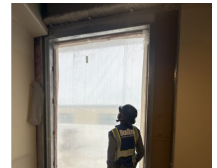
Lewiston – AHU 8 Louver Opening