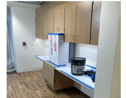
Palouse – B1 MSU Nurse Station