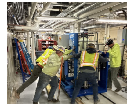
Lewiston – RODI Skid