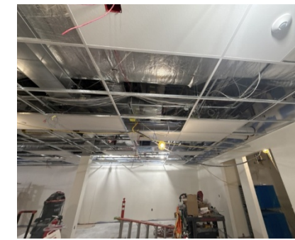
Palouse – Overhead Rough In