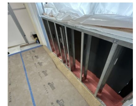
Lewiston – Slab Edge Fire Proofing