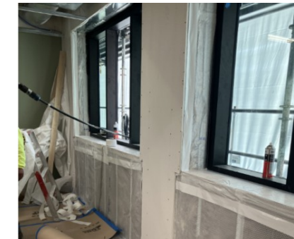
Lewiston – Window Returns