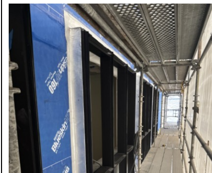
Lewiston – Curtain Wall Frames