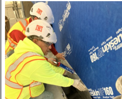
Lewiston – WRB & Flashing